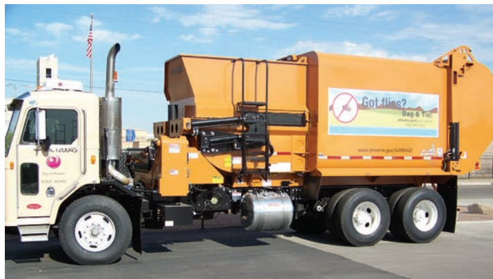
Phoenix switched its refuse truck fleet to re-refined oil – which requires less energy to produce and conserves crude oil – as part of the city’s mandate to lower petroleum use.

Using a re-refined engine oil reduces America’s dependence on foreign oil. It takes 42 gallons of crude oil to make the same amount of high-quality engine oil