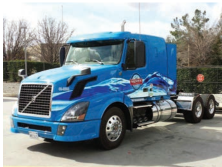
Nestlé Waters is focused on minimizing the environmental impact in the transportation of its products.